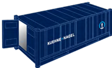
Standard 20' (Dry Container - DC)